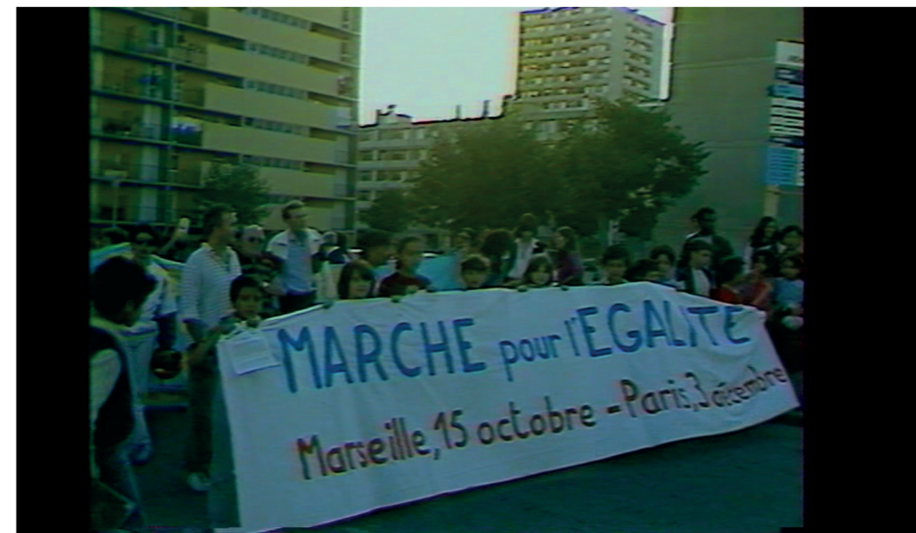
"Retrospective on the March Against Racism leaving from Marseille and arriving in Paris", Television Archive, FR3, INA, 1983/12/03. Id: RAC24000448

Based on a corpus composed of data obtained from the web archive of the INA, which includes web pages referencing the history of the 1983 March for Equality and Against Racism, we explored how this postcolonial event was portrayed online, improving computational methods for text analysis. The study of large corpora of historical data from archived web sources is grounded in a corpus co-constructed with web archivists and focused on the year of the March's thirtieth anniversary in 2013. Semantic network analysis underscores the different interpretations of this historical event.